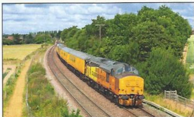
The unusual sight of a Network Rail Test Train on 'our' line during daylight hours- this around 12:30 on 3rd July this year at Gun Lane, Trimley St Martin